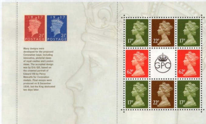
Above: Treasures of the Archive Prestige Stamp Book, Pane 4.