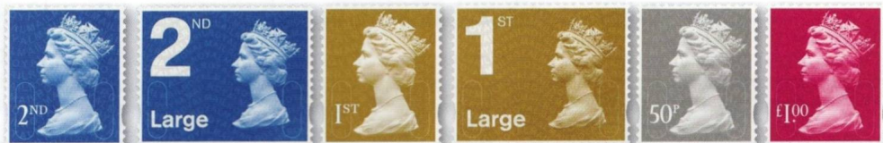
Above: the six security definitives issued in 2009.